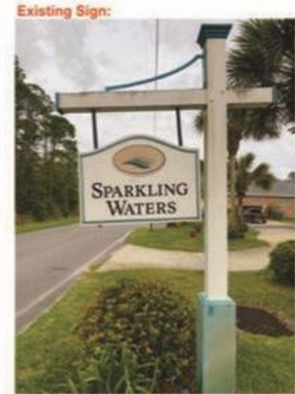
Replace Hanging Sign at West Boundary