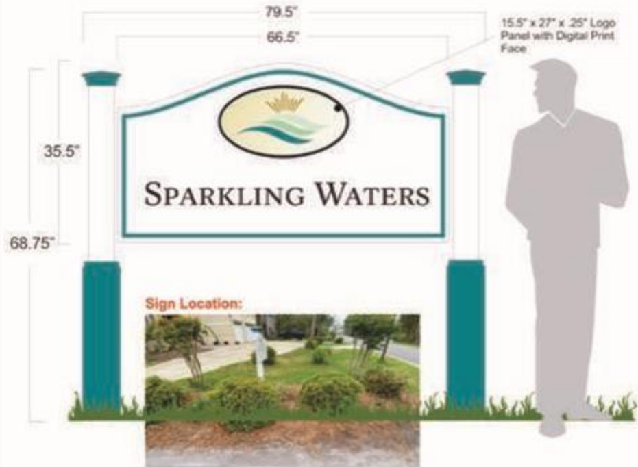
New Entry Sign at Shimmering

1 - 35.5" tall x 66.5" wide x .50" thick Single-Sided Entry Ground Sign Panel with Raised and Painted Border and Dimensionally Carved and Painted Letters "Sparkling Waters"; to include Applied 15.5" x 27" x .25" Oval Logo Medallion with Laminated Digital Print Face. Mounted on 5" x 5" x 68.75" tall (above grade) H-Frame with Painted Capitals and Post Bases or Skirts. Cost - $1,890.00 plus tax & installation Installation Cost: $87.50 plus tax